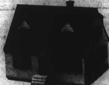
Houses built to CP&L energy efficiency guidelines use up to 40% less energy on heating and cooling.