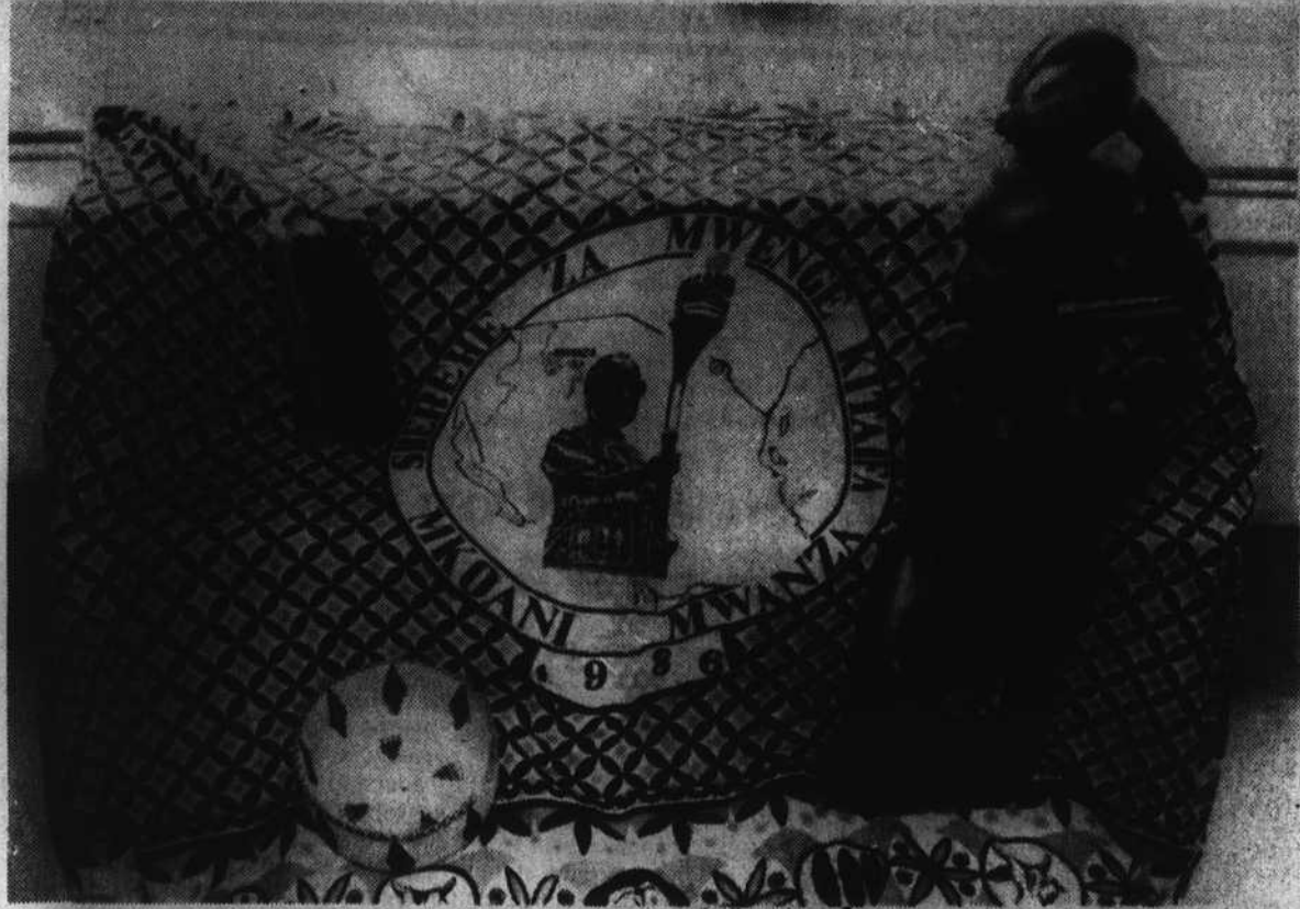
PROJECT TANZANIA —Beginning April 14, the marketplace at 204 Wolfe St. in downtown Raleigh's City Market will be transformed into a showcase for one-of-a-kind pieces of art imported from Tanzania. These original works made by Tanzanian artists will be displayed and sold