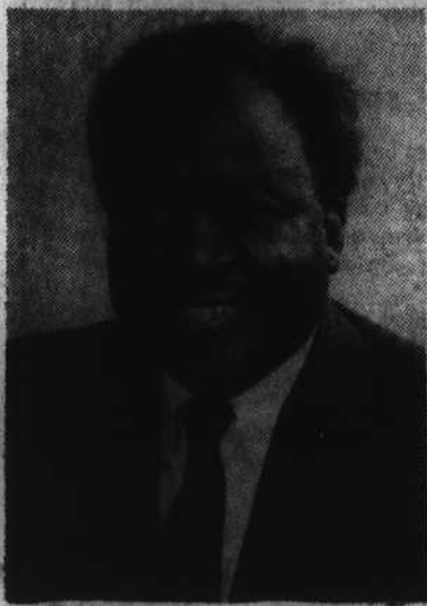
SEN. FRANK BALLANCE

State Sen. Frank W. Ballance, Jr., D-Warren County, presented Senate Bill 828 to the Banking Committee on April 27. The bill was intended to alleviate the flood of bad checks into the banking system. The bill was killed by heavy lobbying by the banking industry and did not receive a single vote of support from the group.