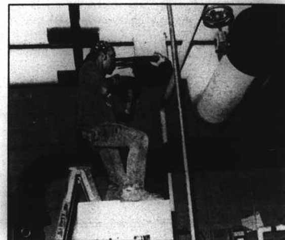
Most instructional spaces will be air-conditioned by the end of 1992. Here a worker installs a system at Garner High.

While Phase II of the building program will bring air conditioning to every school by the end of 1994, schools included in Phase I began receiving air conditioning this year. Kingswood Elementary is now air-conditioned, and five high schools being expanded should have air conditioning by the end of 1989.