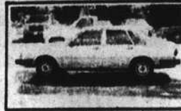
80 AUDI $988 DOWN