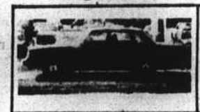
85 VOLVO DL 4 Door, 5 Speed $7,995

BEECHAM and LUCAS AUTO SALES 501 Tryon Rd., Raleigh Just Off US 70 East Behind Tryon Hills Deli 779-9107 DOWN PAYMENT DOES NOT INCLUDE TAX AND TAGS