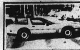
85 CHEVY CORVETTE Automatic, T-Tops $13,995