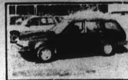
83 MERCURY LYNX WAGON $988 DOWN