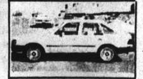
85 FORD ESCORT 19,000 Miles $988 DOWN