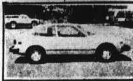
79 HONDA CIVIC $688 DOWN