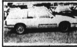
82 CHEVY CAVALIER WAGON $988 DOWN