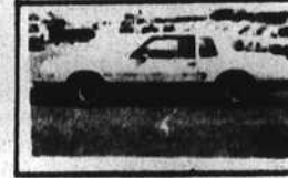
81 CHEVY MONTE CARLO $988 DOWN