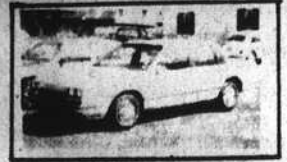
83 CHEVY CELEBRITY $988 DOWN