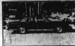
80 MERCURY MARQUIS $888 DOWN