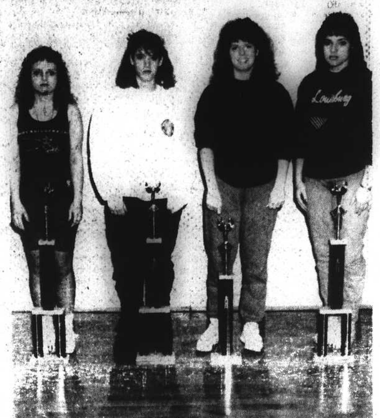
IMPRESSIVE SHOWING—The Garner Road Family YMCA held it's Annual Bench Press Meet on February 11, 1990. Participants from throughout Wake County joined in to compete for top Trophies, impressive showings were among Males and Females. This event was sponsored by the YMCA Physical Development