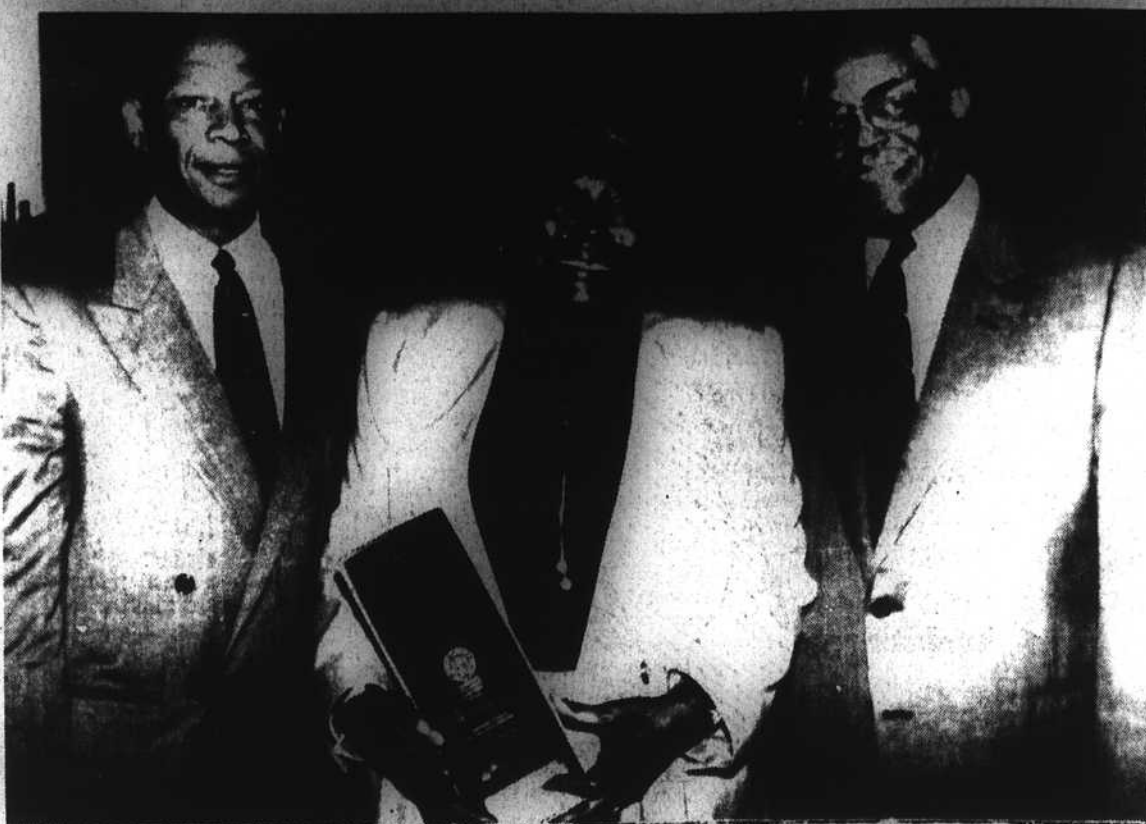
LEADERSHIP AWARD—Esther Rolle (second, right), displays the 1990 NAACP Chairman's Civil Rights Leadership Award that the veteran actress received at the NAACP 81st national convention recently in Los Angeles. Ms. Rolle, an Emmy award winner with over four decades of acting experience, is the third recipient of the annual award, which honors individuals who have made