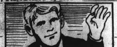
The only American author to win the Pulitzer Prize four times was poet Robert Frost.