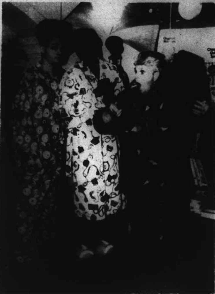
JOKE'S ON US! —Rappers Kid 'N' Play think they are doing a photo session for their latest film but suddenly find themselves in the middle of a geriatric music seminar as part of an elaborate practical joke on "Super Bloopers & New Practical Jokes," airing on NBC-TV, Sunday, April 21, 7-8 p.m. Dick Clark and Ed McMahon host the show which also features celebrity flubs and miscues.