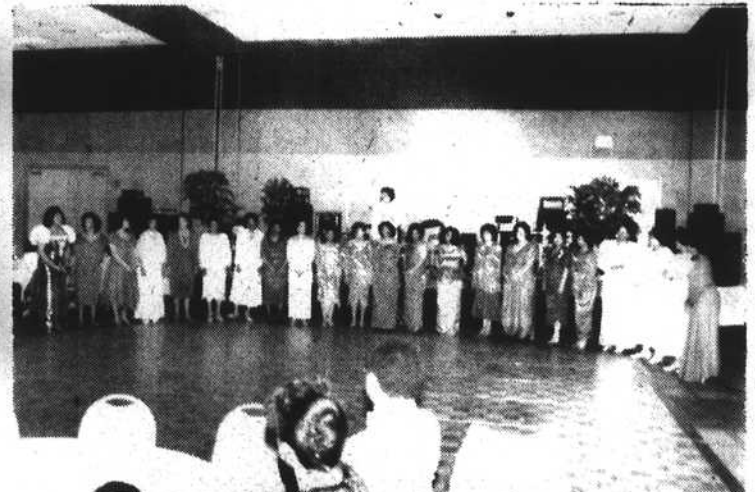
Officers join committee members at front during introductions