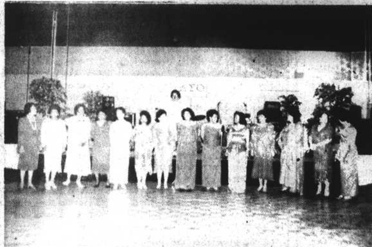
Members Of Charity Ball Committee

This could only be possible due to the splendid support of the public. Members of Delta Sigma Theta Sorority raise the money for this scholarship effort each year. The sorority expresses its gratitude to its man supporters.