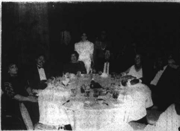
Guests are really enjoying themselves at this soror's table.