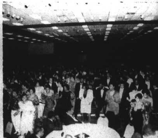
So that is the way you do the electric slide.