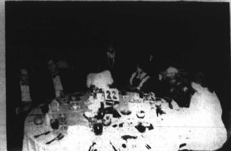
Guests fraternize at Delta Ball on April 5, 1991.