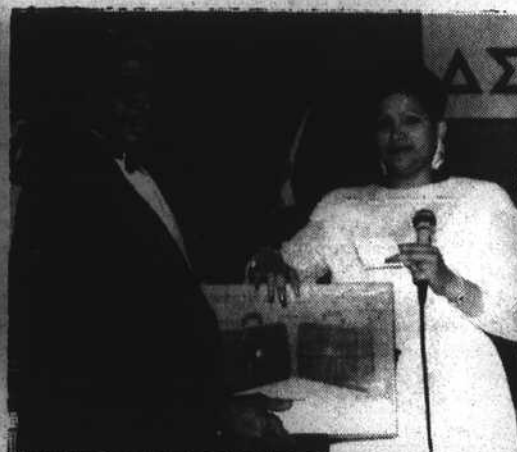
Lucky guest receives door prize.