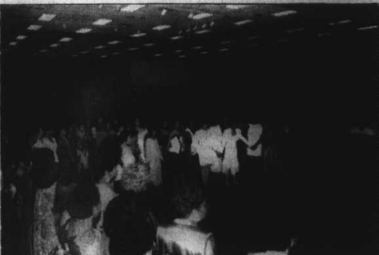
Deltas sing their sweetheart song.