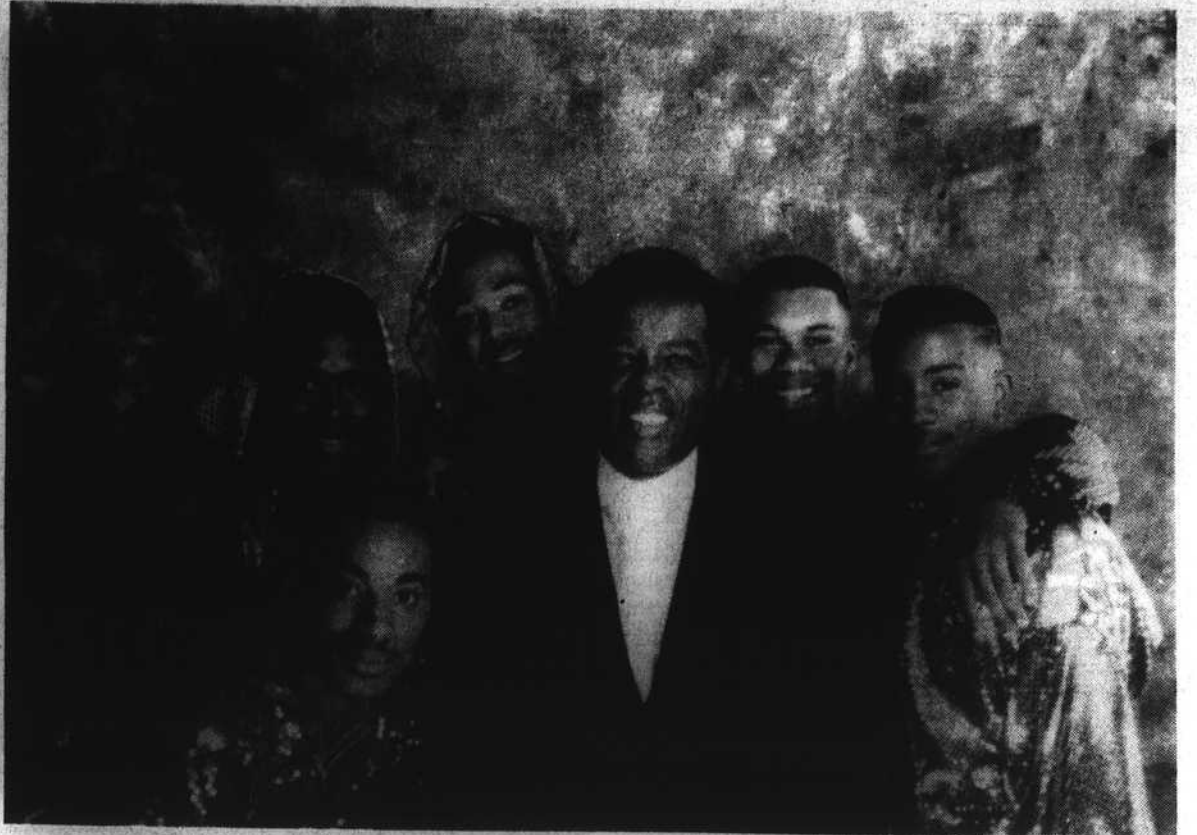
UNCF TELETHON —“Lou Rawls Parade of Stars” telethon to benefit the United Negro College Fund will be aired Dec. 28. The entertaining special will feature an array of stars and performances including the Hi Five. Approximately 51,000 students are enrolled in these 41 private, historically black colleges and universities.