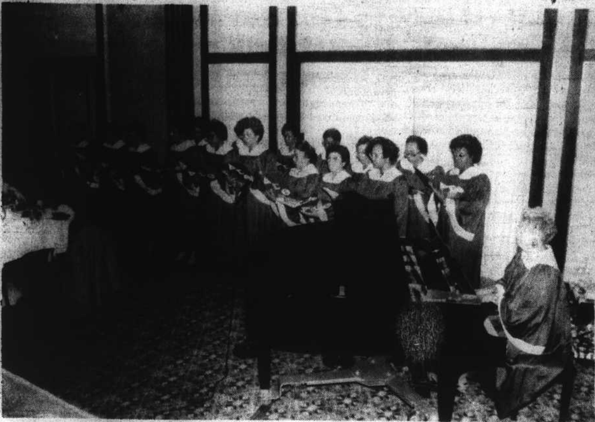
SONGS OF CHRISTMAS — Delta Ensemble sings for annual Christmas breakfast on Saturday, December 21 at the Crabtree Marriott Hotel. The ensemble sang the music of the Christmas season as sorors brought gifts of money for the Method Day Care Center, gifts for the Wake County Department of Social Services, and school supplies for the Malindza Refugee Settlement in Swaziland, Africa. Pictured above from left to right, front row: Sopranos,