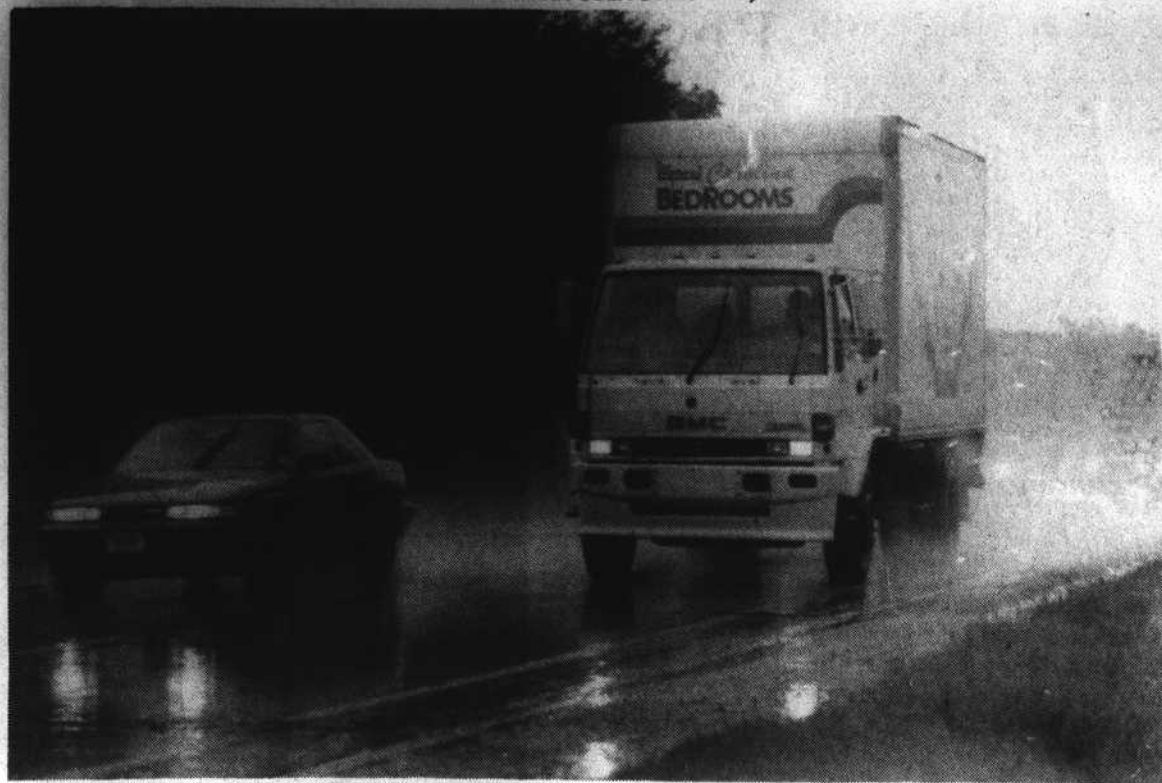
USING LIGHTS IN BAD WEATHER— A new North Carolina law now requires that motorists turn on their headlights and wipers while driving in the rain. The law stems from research done on the number of accidents that have occurred during bad weather.