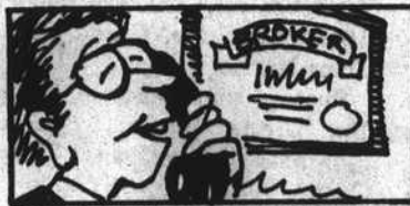
One in five U.S. residents owns stock or invests in stock mutual funds.

Some friends of mine offered to escort me down the aisle of an East Raleigh institution. They also advised me not to be bashful. Maybe I needed the last admonition but I'm sure I needed no help in walking down the aisle. Maybe the Gospel Choir will sing next time. Is that a clue?