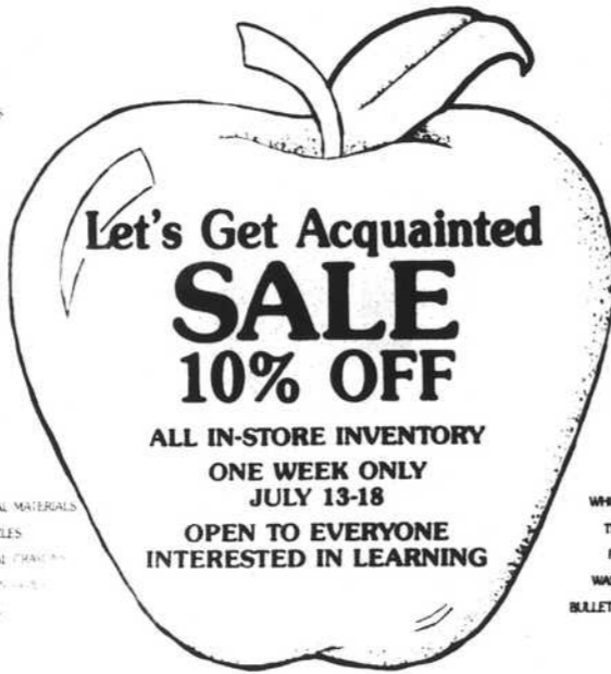
CHART TABLETS LINEAR PIGS STENCILS MARKERS FRASERS STAMPERS SCISSORS GLUE NAME TAGS DESK TAPES MORPHOS CERTIFICATES MATH TAPES PUPPETS MULTICULTURAL MATERIALS WOODEN PUZZLES MULTICULTURAL CRAFTS CONSTRUCTION PAPER MAGNETS

FLASH CARDS PEGBOARDS ATTRIBUTES BLOCKS CRAYONS PENCILS POSTERS NOTE PADS MAPS BORDERS COLUMNS INVENTORS CLIP ART GEOGRAPHY IDEA BOOKS WHOLE LANGUAGE THEMATIC UNITS FLOOR PUZZLES WASHABLE PAINTS BULLETIN BOARD AIDS