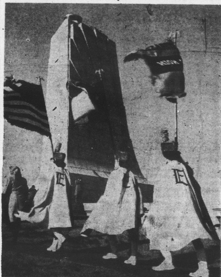
Majorettes of the Elizabeth City High School Band wending their way to the top of Kill Devil Hill Monday morning to take their place at exercises celebration the 48th anniversary of powered flight. The band braved the bitter, biting wind to play patriotic music and flourishes of honor to distinguished guests.

about the complex and perplexing things throughout the world; but we can do much toward making things better in the little orbit that is the world of some unfortunate neighbor or a friend.