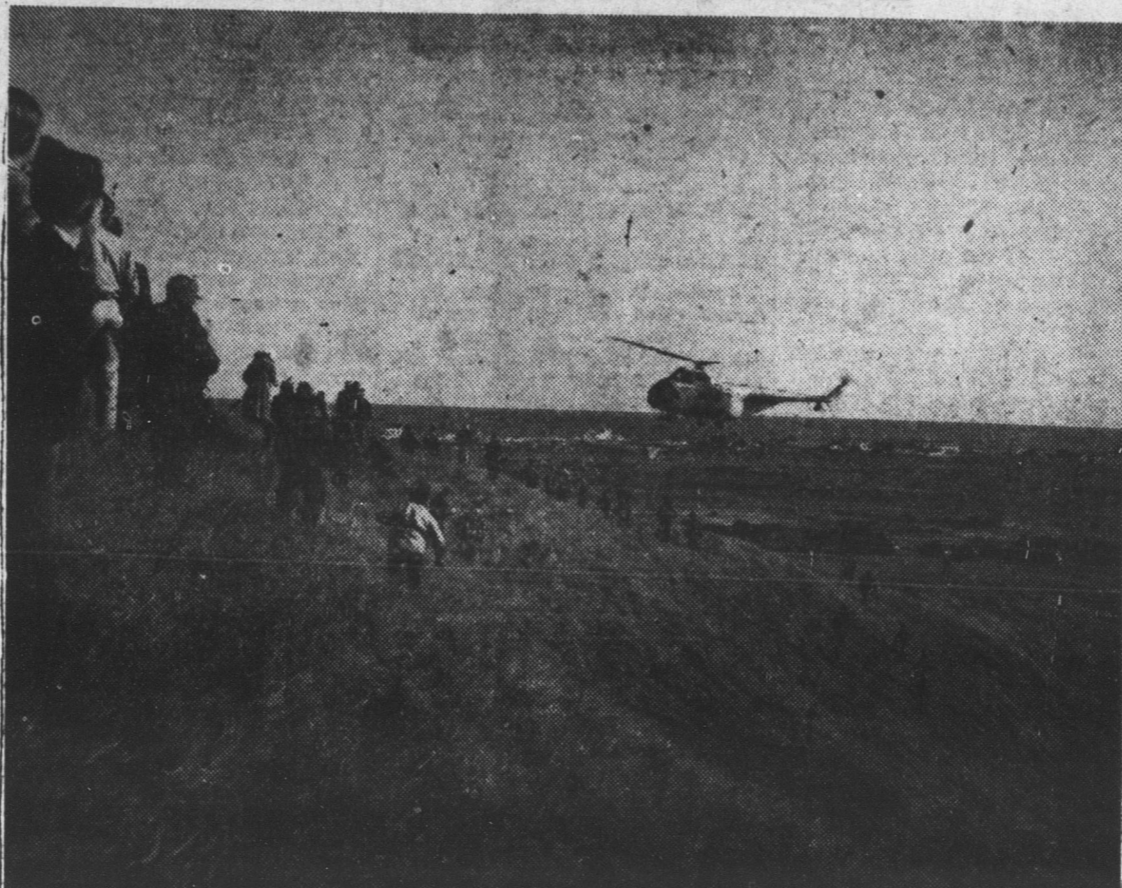
A Coast Guard helicopter landing at the National Wright Memorial at Kill Devil Hill Monday as boys scamper over the slopes at exercises at the Wright Memorial pylon. At the foot of the hill are four buses belonging to the Elizabeth City High School Band.