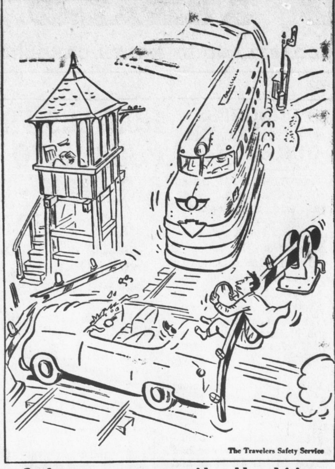
Lucky you-you got away with reckless driving