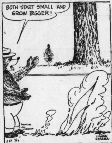
Both start small and grow bigger! You can't sell fire—but you can sell trees!