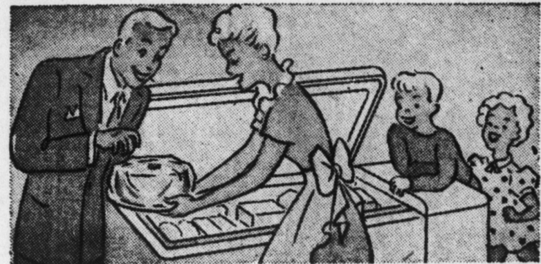
FOOD FREEZERS —pay their own way in many farm homes.

frozen food than they normally would get for daily needs. They cooked what they needed for one meal and froze the rest for later use. A number of the freezer owners said they found it was easier, faster and more efficient to preserve food by freezing than by other methods. Better year-round eating and the ability to serve "more interesting meals" also appealed to a large group.