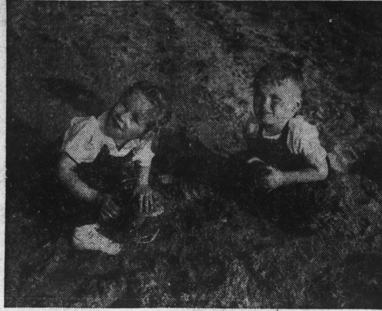
A high camera angle on this picture shows the action clearly and provides a neutral background which helps tell the story.