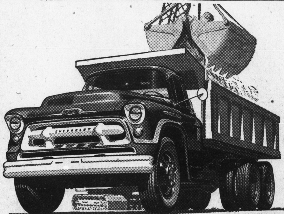
New Heavyweight Champs