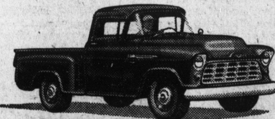
New Lightweight Champs

In new Task-Force six-wheelers you get the last word in modern V8 power with the big new 322-cubic-inch Loadmaster. You get Power Steering, too, and a new 5-speed transmission! With the tandem's built-in 3-speed power divider, this gives you 15 forward speeds and 3 reverse! New rear suspension eliminates the need for spring lubrication! Stop in soon for details!