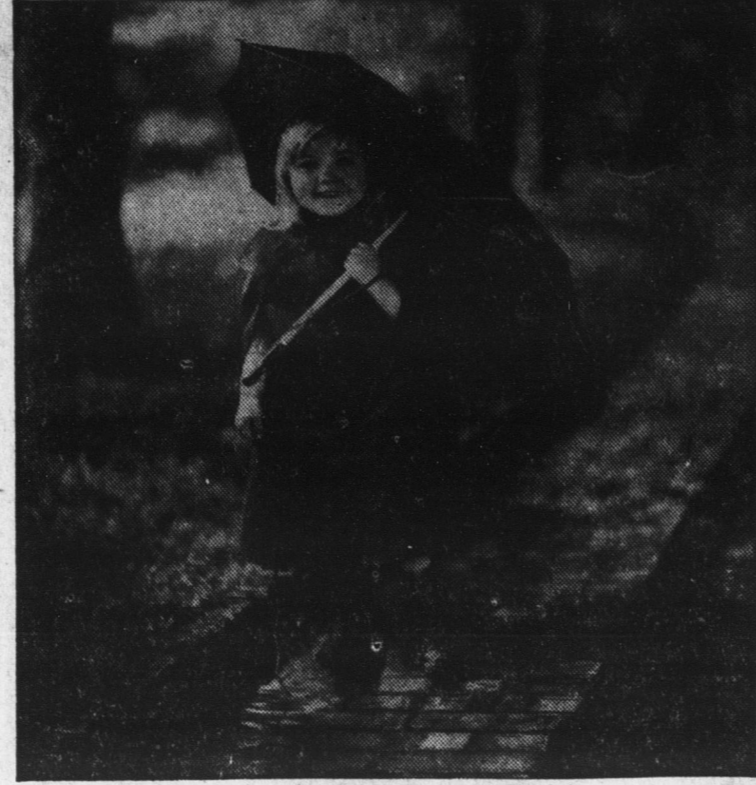
A picture like this offers a nice change of pace from the more usual sunny day snapshots of children.