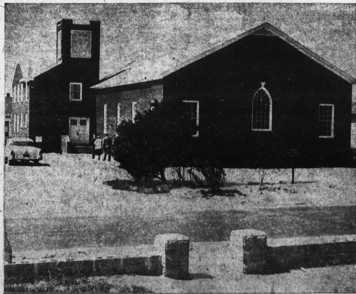
Completion of a sanctuary, on a $75,000 building program was observed March 31 with a completely filled auditorium, at Hatteras. The red brick structure is the largest Methodist Church of six on Hatteras Island. Rev. Ray Sparrow is pastor.