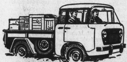
The New Forward Control 'Jeep' FG-150... puts a 74" pickup box on a wheelbase only 81" long.

Let us prove what a 'Jeep' vehicle can do for YOU!