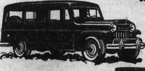
The 'Jeep' Utility Wagon... dual purpose vehicle for business and family.