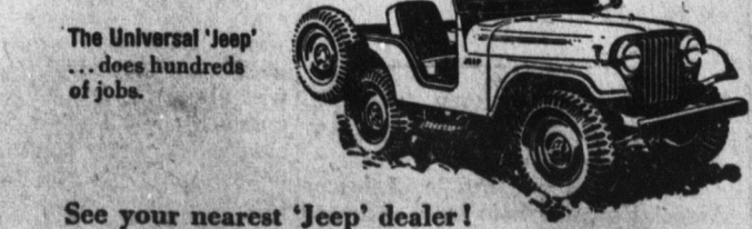
The Universal 'Jeep'... does hundreds of jobs.

It's good insurance and good business to see from an actual on-the-job demonstration just how a 'Jeep' vehicle can help you get more work done every day in the year on your jobs. These vehicles are rugged, powerful and versatile! They have the extra traction of 4-wheel drive to take you and a full payload over the roughest terrain, in good weather or bad. On the highway, they shift easily into conventional 2-wheel drive for travel at top legal speeds. And, with power take-off, they operate a wide variety of special equipment. There's a 'Jeep' vehicle ready to fill your specific needs. Get an actual demonstration and prove to yourself that a 'Jeep' vehicle will do your jobs best.