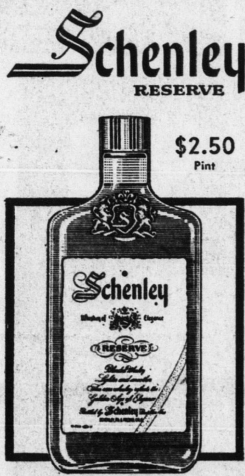
Blended Whisky, 86 Proof, 65% Grain Neutral Spirits, Schenley Dist., N.Y.C.