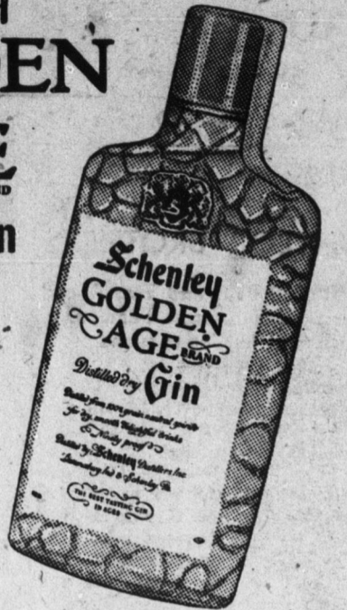
Schenley Distillers Co. Distilled Dry Gin. From 100% Grain Neutral Spirits. 90 Proof.