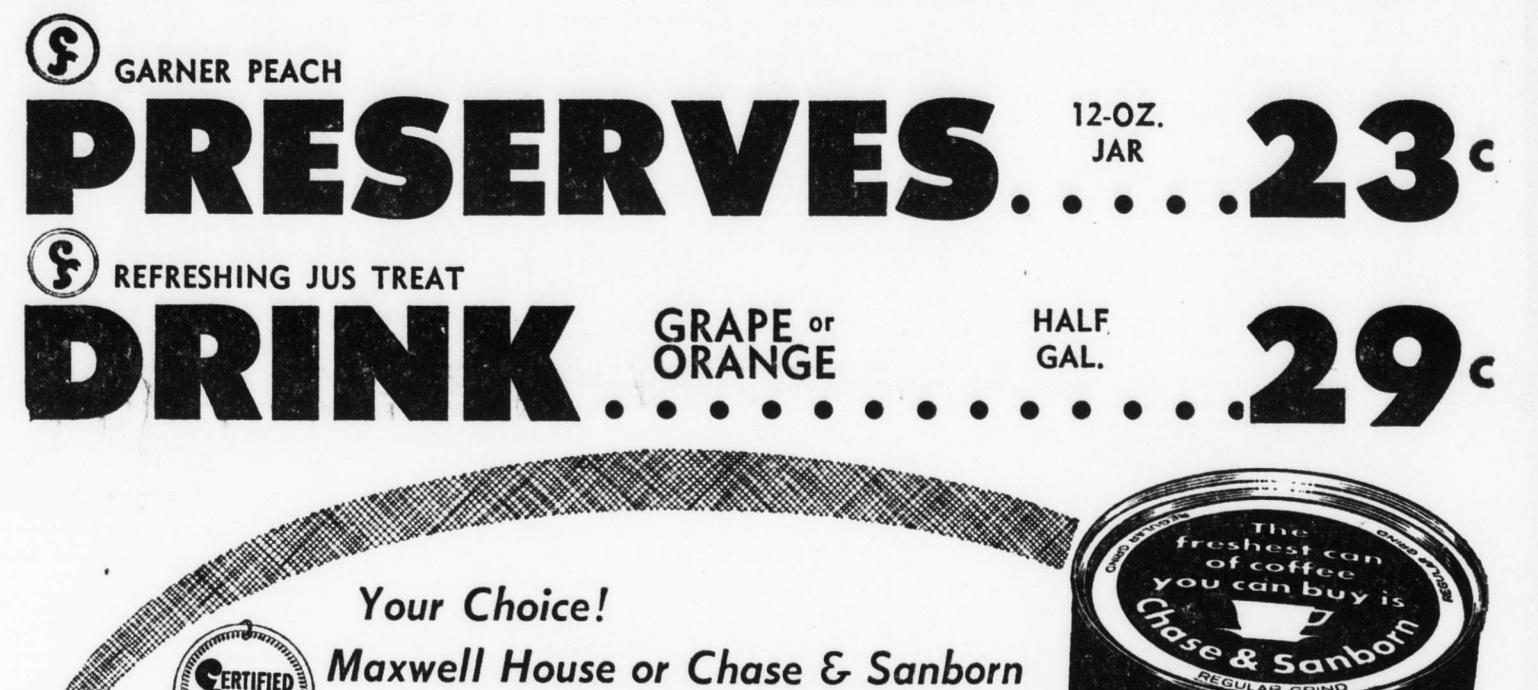
FRIDAY, SEPTEMBER 16, 1960