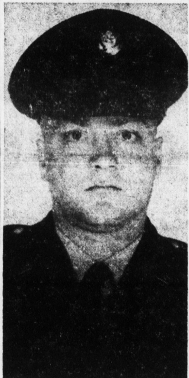
FORT JACKSON, S. C., Feb. 14