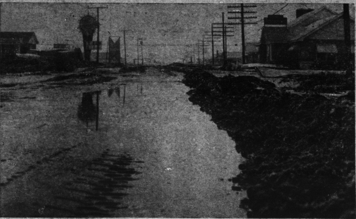
BUSINESS HIGHWAY 158 was handling little traffic on Friday morning of last week when highway crews worked overtime to remove sand and debris from the water-soaked link from Kitty Hawk to Nags Head. The photo was taken one-half mile north of the Dolphin Motor Court. Owens Restaurant is shown on the right with the Sea Otel and Dareolina Restaurant in the background.