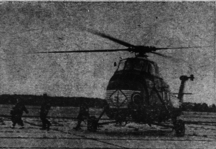
A MARINE CORPS HELICOPTER from Cherry Point is shown here at Manteo Airport discharging evacuees from Hatteras during the peak of rescue operations on Thursday morning. All stranded Outer Bankers had been accounted for by Thursday afternoon.