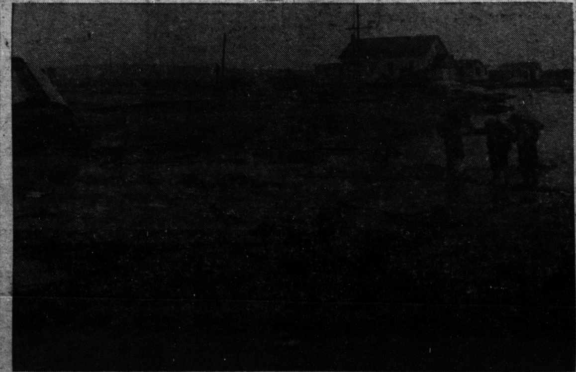
THE "INLET" at Nags Head, credited with saving many from worse flooding, also played havoc with some houses and other property in the area of "Old Nags Head." It is reported that when the road (By-Pass 158) broke, the water level dropped as much as a foot as far north as Kill Devil Hills. This photo, made Friday afternoon, shows a make-shift walkway being used by displaced persons returning to their homes. The break has been filled by highway crews, and is now passable to motor traffic.