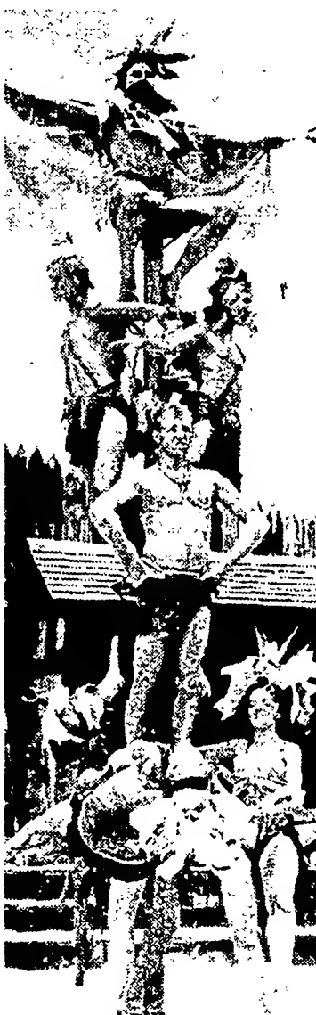
PAUL GREEN'S EPIC SYMPHONIC HISTORICAL DRAMA is in its 28th season on the Fort Raleigh National Historic Site near Manteo. Scenes from "The Lost Colony" and a view of the Waterside Theatre on the Dare Coast-Outer Banks are shown above. The show is staged by Joe Layton of Broadway, TV and Hollywood fame. Performances are given every night except Sunday through August 25, with special showings on Sunday nights of August 18 (Virginia Dare's birthday) and closing night.