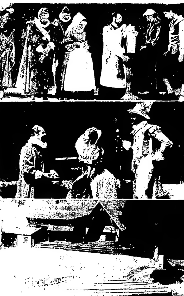
Director Joe Layton's fifth production of Paul Green's pioneer outdoor symphonic drama, "The Lost Colony" kicks off a scheduled 58-performance season Friday night in Waterside Theatre, Roanoke Island. It will be the 28th production year of the historical spectacular since it was first presented on the Fort Raleigh National Historic Site in 1937. The show was suspended for four years during World War II.