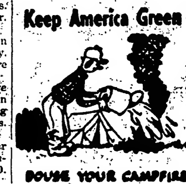
BOUSE YOUR CAMPFIRE