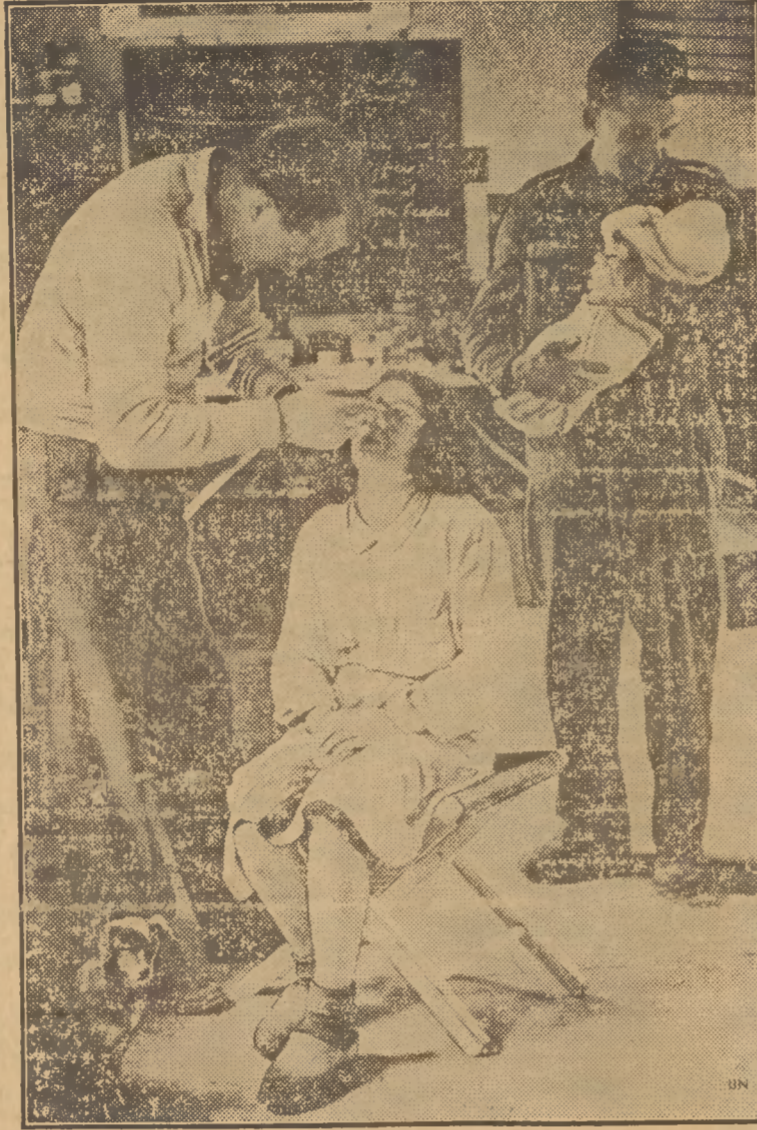
IN A VILLAGE SCHOOLROOM near Caen, in Normandy, a British doctor from a nearby R.A.F. airfield—from which fighter planes continually go out to strike at the enemy—gives his spare time to caring for the local French people, who are short of doctors. In this picture he is attending to a mother while an airman holds her baby. Note the sympathetic pup in the left corner.