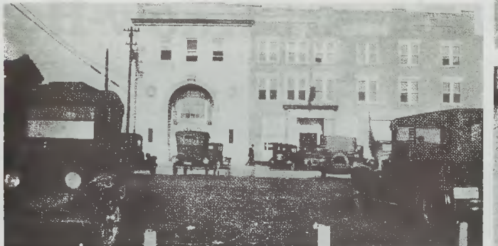
The Bank of Ahoskie, as seen from No Man's Land, in the 1920's before the Great Depression.