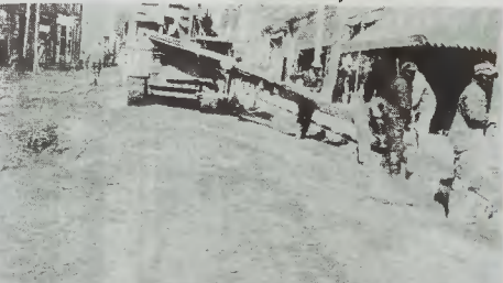
Main Street gets its first pavement, probably in the late 1920's.