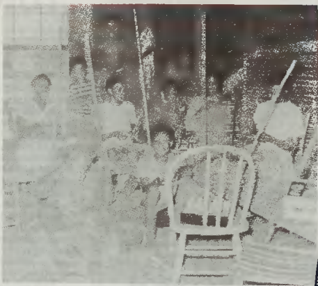
Grading and tying tobacco to get it ready for sale in 1959.