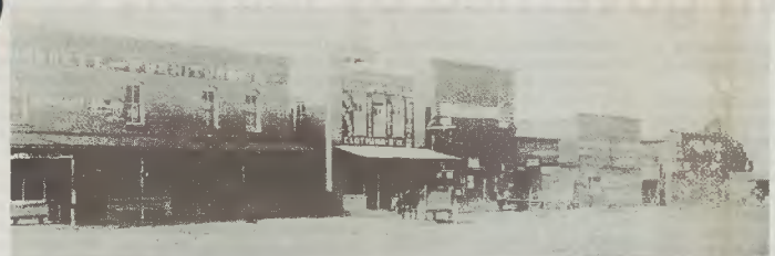
Downtown Ahoskie didn't have paved streets when the town was only a few years old.