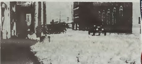
A mighty snow fell on Main Street in 1927 or was it '28?